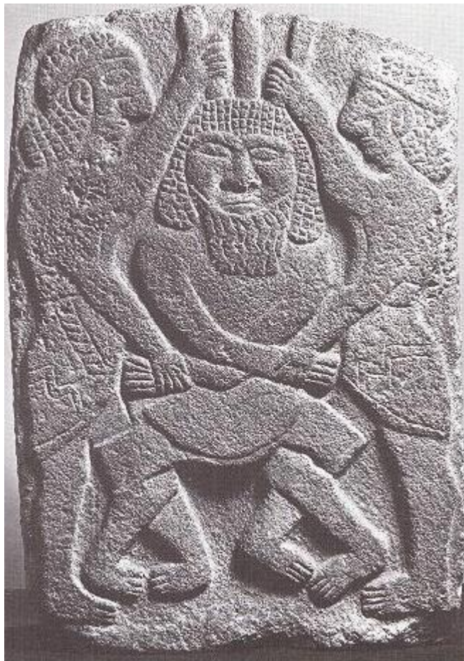
Gilgamesh and Enkidu's battle with Humbaba.

Gilgamesh replied: 'Where is the man who can clamber to heaven? Only the gods live for ever with glorious Shamash, but as for us men, our days are numbered, our occupations are a breath of wind. How is this, already you are afraid! I will go first although I am your lord, and you may safely call out, "Forward, there is nothing to fear!" Then if I fall I leave behind me a name that endures; men - will say of me, "Gilgamesh has fallen in fight with ferocious Humbaba." Long after the child has been born in my house, they will say it, and remember.' Enkidu spoke again to Gilgamesh, 'O my lord, if you will enter that country, go first to the hero Shamash, tell the Sun God, for the land is his. The country where the cedar is cut belongs to Shamash.'