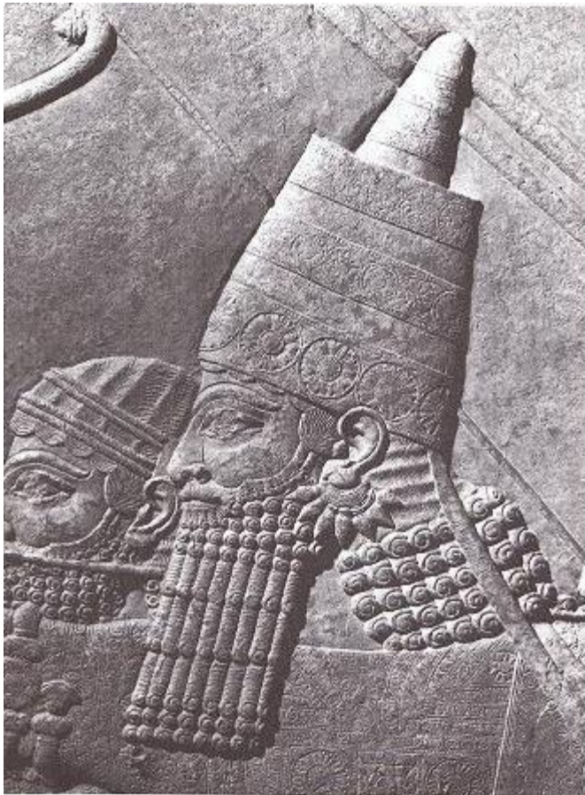
King Ashurbanipal, 669-627 B.C.. The excavations of his library provided a major source of Mesopotamian literature, including a good portion of the Epic of Gilgamesh.

So the trapper set out on his journey to Uruk and addressed himself to Gilgamesh saying, 'A man unlike any other is roaming now in the pastures; he is as strong as a star from heaven and I am afraid to approach him. He helps the wild