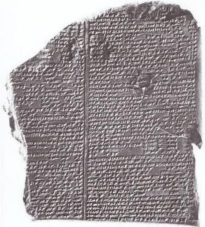
A fragment of a tablet showing the story of the flood, inscribed in Assyrian cuneiform characters.

-'Then was the launching full of difficulty; there was shifting of ballast above and below till two thirds was submerged. I loaded into her all that I had of gold and of living things, my family, my kin, the beast of the field both wild and tame, and all the craftsmen. I sent them on board, for the time that Shamash had ordained was already fulfilled when he said, "in the evening, when the rider of the storm sends down the destroying rain, enter the boat and batten her down." The time was fulfilled, the evening came, the rider of the storm sent down the rain. I looked out at the weather and it was terrible, so I too boarded the boat and battened her down. All was now complete, the battening and the caulking; so I handed the tiller to Puzur-Amurri the steersman, with the navigation and the care of the whole boat.